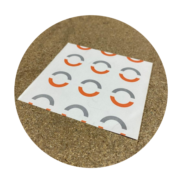
For Use in Common Built Environments Fast, clean dry-laid installation process suitable

Fast, clean dry-laid installation process suitable for most common sub-floors.